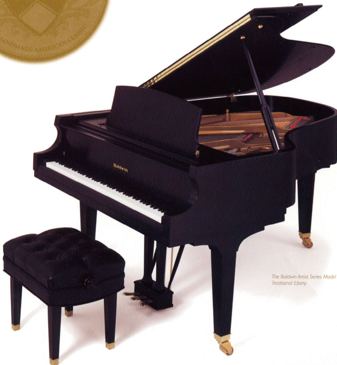
The Baldwin Artist Series Model L1. Traditional Ebony

THE BALDWIN L1 , a 6'3" Artist Grand, is designed for elegant environments that require a piano with exceptionally powerful, distinctly American tone and presence. Preferred by many jazz musicians, the L1 features the exclusive Baldwin Action, which provides highly sensitive response for the most demanding pianist.